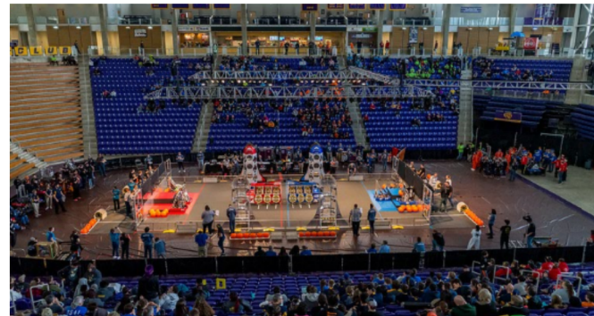
Robotic League Competition at University of N. Iowa