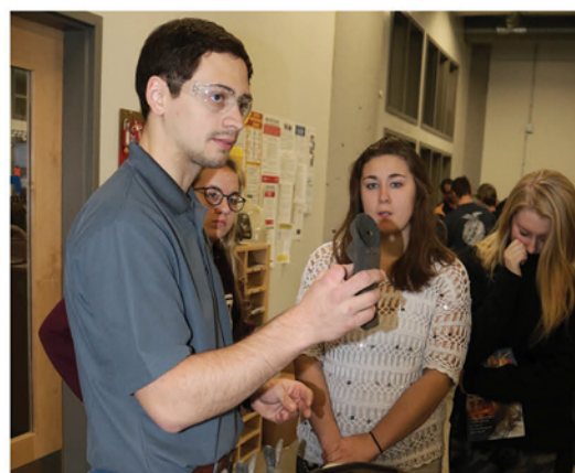
UNI Metal Casting Center Staff giving tour to area high school students.